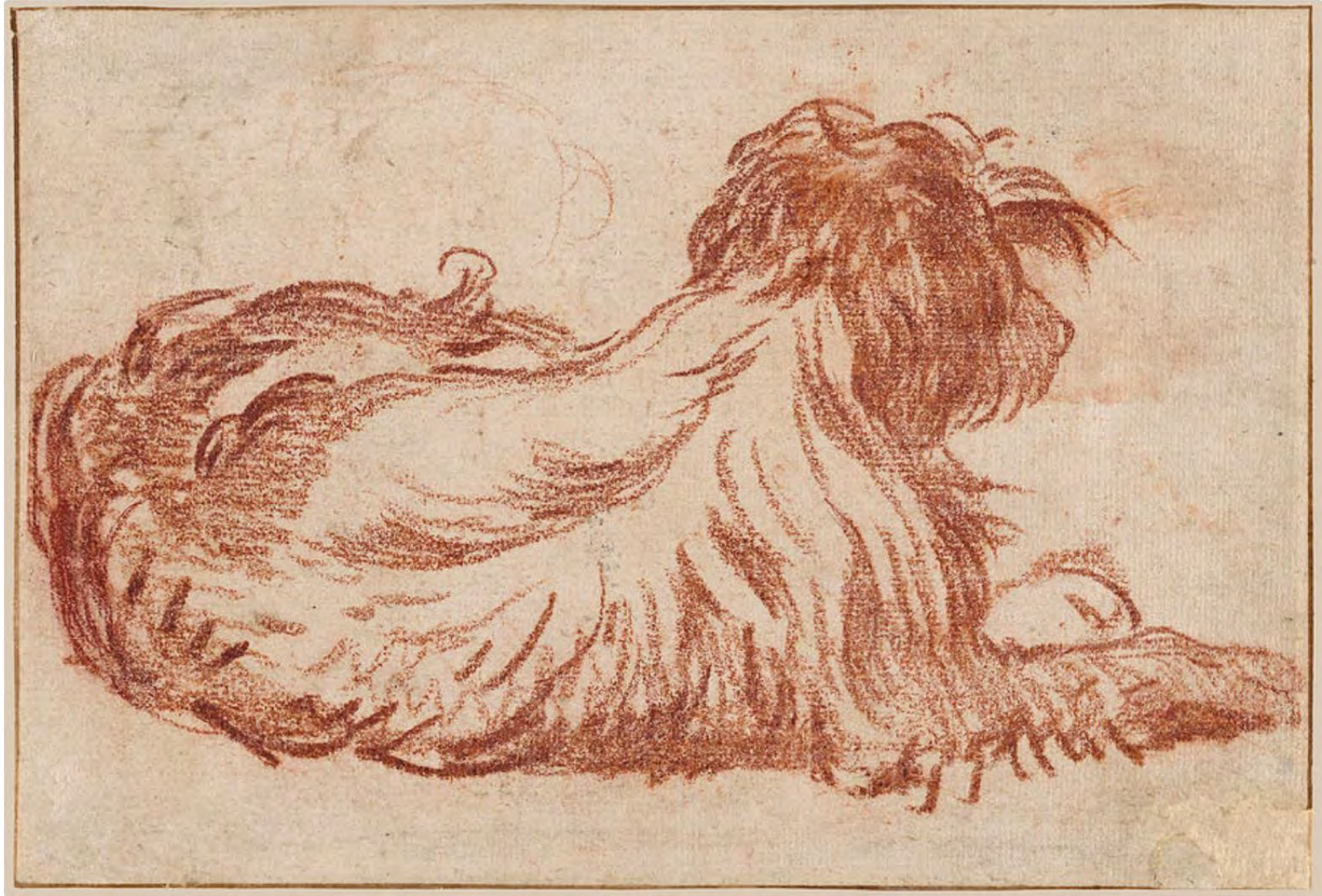
Jean-Baptiste Greuze (1725 – 1805)