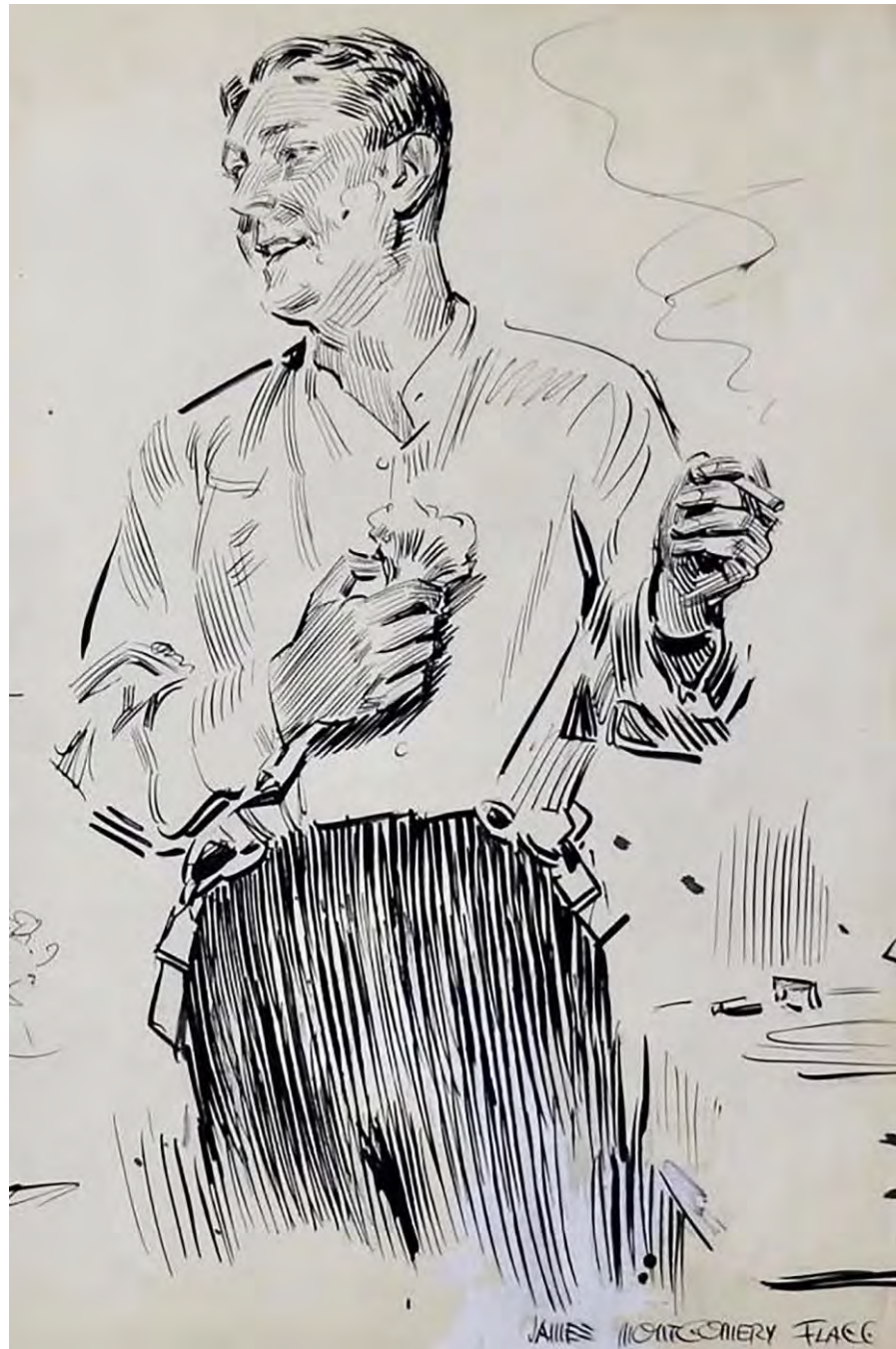
James Montgomery Flagg 1877 -1960)